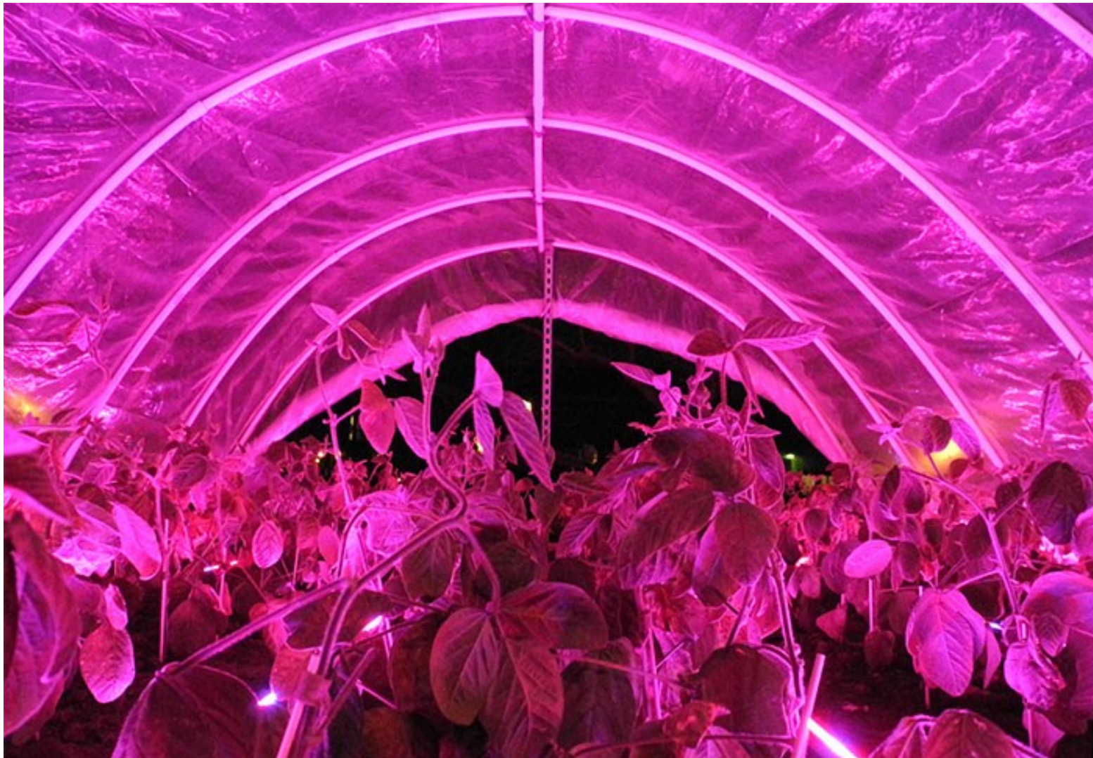
National Security Garden, Purdue University 4/13-8/13