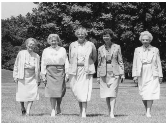
Purdue, "Five Women Deans," date of photo unknown

You'll be divvied up into scavenger hunt teams of 3-4 people and turned loose to explore places and resources of especial interest to CLA students. Report back for snacks and debriefing by 8:30 p.m. There will be prizes and CLA swag!