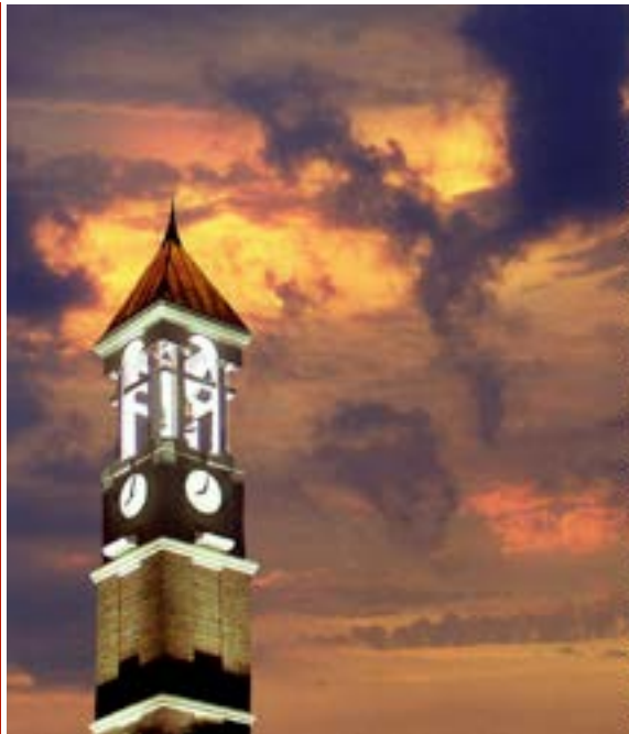
At right: The Purdue bell tower, "one brick higher"; Purdue students at the 2011 Hunger B

The problem is, of course, that not everyone has had the kind of introduction to research and citation practices that I assume. Please come and see me if you are a) unsure about how to make proper citations—bring in a past paper if you like, and we can work through it—or b) overwhelmed by an assignment and are starting to get panicky about its completion. The temptation to plagiarize can be overwhelming at such times. While I most likely will not be setting aside time in class to talk about research approaches and citation issues, I am very happy to help you figure these things out on your own, in small groups, or in office hours.